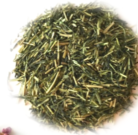
Green tea stems (kukicha)